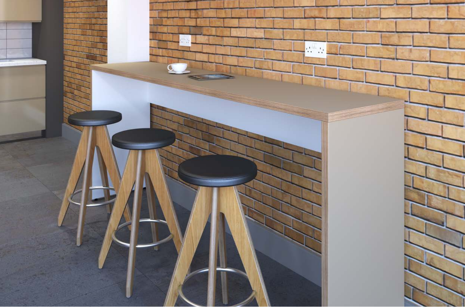
Meet, eat and work at our contemporary collaborative tables perfect for touchdown working and informal meetings.